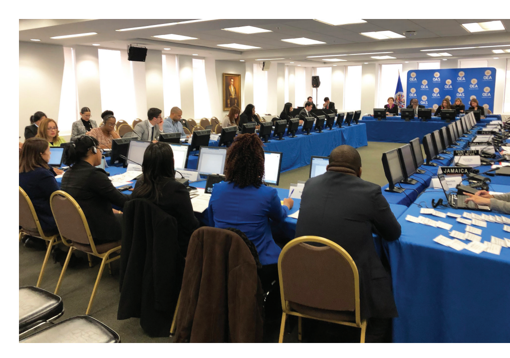
MEM Seventh Round Plenary Meeting in Washington, DC – March 2019

CICAD's Hemispheric Plan of Action on Drugs 2016-2020 addresses the various drug-related laws and regulations that take into account human rights and gender issues. Member states are encouraged to enhance international cooperation in accordance with international legal instruments. Twentythree OAS member states<sup>37</sup> have adopted legislation and/or administrative measures to implement obligations relating to human rights and gender equality acquired through international legal instruments on the world drug problem.